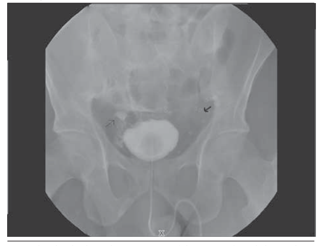
Note the dye leak in the cystogram (thin arrow) and the tuckers of mesh fixation on both sides (thick arrow). This patient was treated by simple bladder transurethral catheter drainage for 7 days. No intervention was needed.