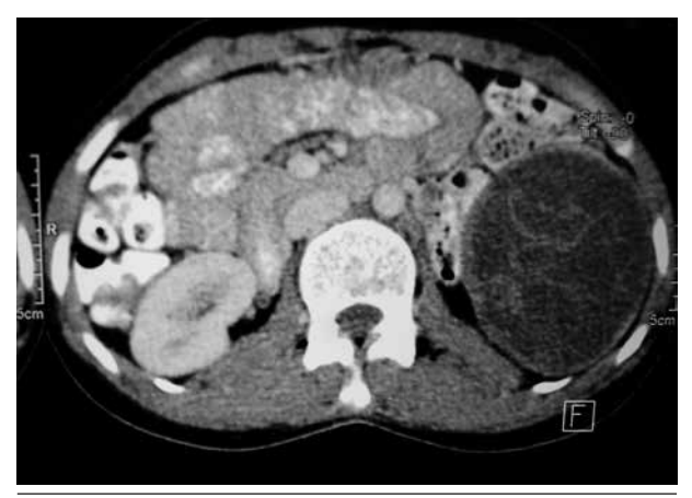
Figure 1. Harmonic Scalpel Used in Dissecting the Cyst From Lateral Wall

Hydatid disease in humans occurs as a result of infection by the larval stages of taeniid cestodes of the genus Echinococcus. Certain human activities (i.e. the widespread rural practice of feeding dogs the viscera of home-butchered sheep) facilitate transmission of the sheep strain and consequently raise the risk of humans getting infected (3). Hydatid cysts of the spleen are the only recognized parasitic cysts and are known to be at least twice as common as the non-parasitic variety (1). Systemic dissemination and intra-peritoneal spread from a ruptured lived cyst are the potential theories behind development of splenic hydatid cysts. The embryo is embolized in the periphery of splenic capillaries. The incompressible mass of the cyst gradually crushes the segmentary vessels, with extensive pericys-