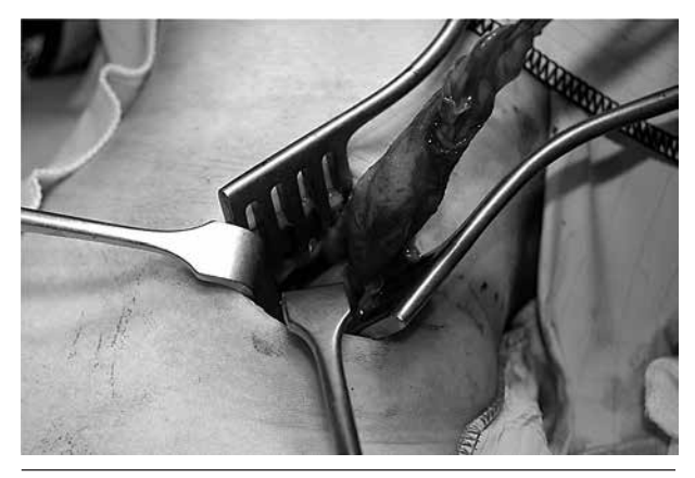
Figure 2. Intra-Operative View Demonstrating Stripping of the Branchial Cyst From Within the Abscess Cavity

out a definitive treatment simultaneously and this was explained to the patient and her parents. The patient was taken to theatre where under a general anaesthetic with the neck extended and turned to the right, an abscess was opened and drained. A 3cm transverse skin crease incision was employed and more than 200 mL of pus evacuated. The lining of the abscess was then stripped off the capsule in a continuous piece, starting immediately under the wound, extending to its inferior and lateral limits before finally removing the superior aspect. (Figure 2) For the most part, despite the infection, separation was relatively bloodless and expeditious. Feeder vessels were controlled, as and when encountered, with bipolar diathermy. The resultant cavity was checked for haemostasis and after comprehensive washout was drained with a suction drain. The patient was sent home the following day and the drain removed 48 hours later. Microbiology of cyst's content revealed nil growth and histology confirmed a squamous epithelium lined branchial cyst with associated acute and chronic inflammation without dysplasia or malignancy. On medium term follow up no recurrence