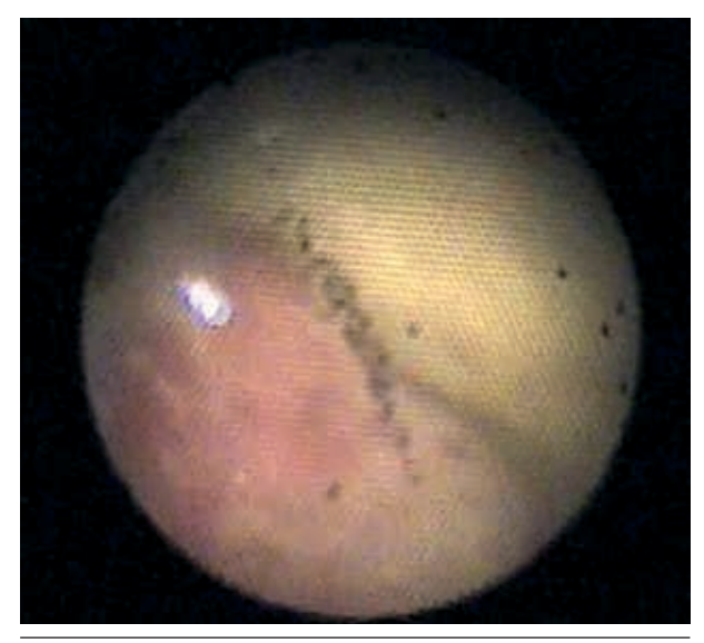
Figure 4. A 2-cm by 2-cm Ulcer in the Remaining Part of the Stomach