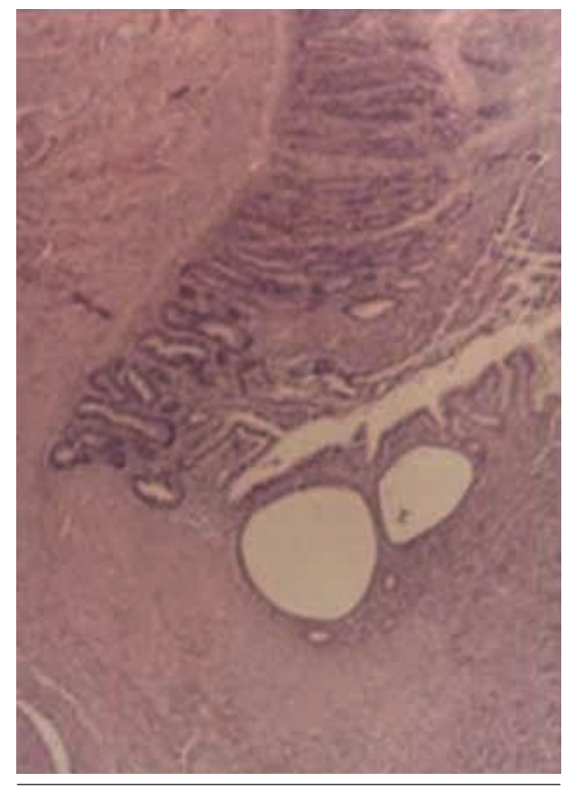
Figure 6. Gastrojejunal Anastomotic Site with Cystic Dilatation of the Jejunal Crypts

1 animal of group A (Figure 4). Macroscopic pathologic evaluation revealed normal healing of the incisional scars, without any inflammation, abscess, adhesion, or other acute or chronic inflammatory reactions. The abdominal organ topographies were normal, and no peritonitis signs were evident. Some minor adhesions were noted between the abdominal organs in both