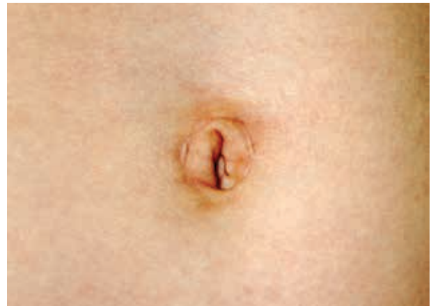
Figure 4. Final Aesthetic Outcome With Incision in Superior Umbilical Fold Barely Evident

wound was closed in layers leaving the umbilical profile intact ( Figure 4 ). The patient was discharged the following day and a year later is in excellent health. Histology confirmed a benign serous cystadenoma and repeat ultrasonography has demonstrated resolution of the hydronephrosis.