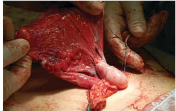
Figure 3. Delivery of the Right Ovary Into the Wound for Inspection