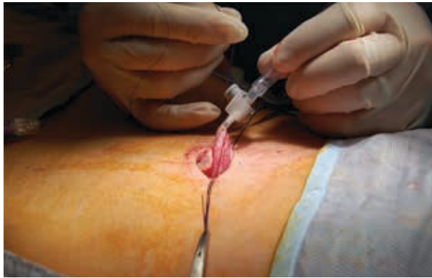
Figure 1. Drainage of the Serous Cystadenoma Using a Large Intravenous Cannula Attached to Suction

Stay suture in right hand controls any tendency to spillage. Sutures held on mosquito forceps are holding open the vertical incision in linea alba.