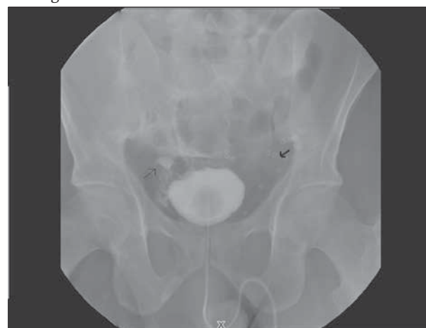
Figure 2. Bladder Injury After Laparoscopic TAPP Repair of Bilateral Inguinal Hernia

Note the dye leak in the cystogram (thin arrow) and the tuckers of mesh fixation on both sides (thick arrow). This patient was treated by simple bladder transurethral catheter drainage for 7 days. No intervention was needed.