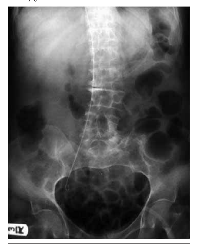
Figure 2. The Abdominal X-Ray Showing the Guide Wire in the Right Common Iliac