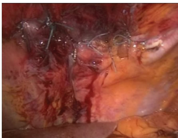
Figure 2. Laparoscopic View After Primary Repair of Hernia