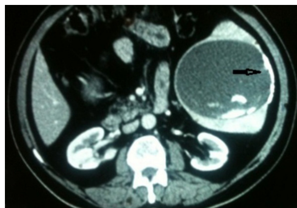
Figure 1. Photograph of CECT Film Showing Cyst With Curvilinear Calcification

and endemic nature of disease, hydatid cyst of spleen was considered as first diagnosis. To the desire of the patient and favorable location of the cyst, we went for the laparoscopic intervention.