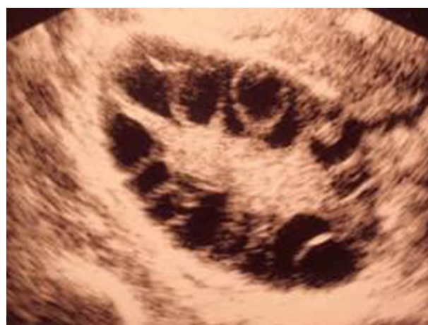
Figure 1. Ultrasound Picture of PCO

The principal features of PCOS are anovulation, resulting in irregular menstruation, amenorrhea, ovulation-related infertility, and polycystic ovaries. The main features of our patient, including primary amenorrhea, infertility and ultrasound (U/S) report, as well as laparoscopy con