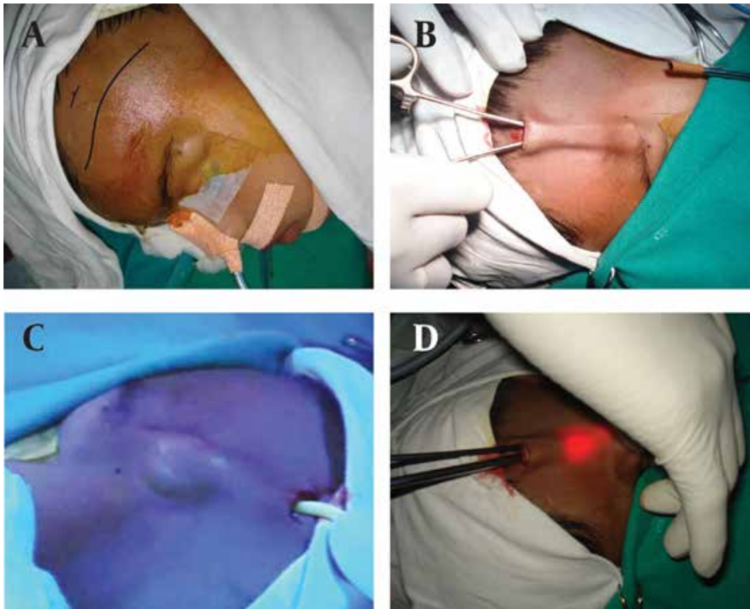
Figure 1. A) Angular Dermoid Over Left Side of Eyebrow, B) Creation of Subcutaneous Plane With Artery Forceps, C) Expansion of Subcutaneous Space, Aided by Insufflations Of Balloon, D) Telescope With Working Ports