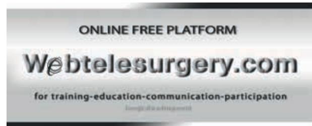
Figure 1. Webtelesurgery Online Free Platform for Training-Education-Communication and Participation

Doing sufficient experiments, we decided to consider a Multi-National Project as a training center in distance videoscopic surgery in different applicant countries, especially Euro-Mediterranean, with the supports of “webtelesurgery.com” platform with regard to the two training centers in Brussels and Istanbul (Figure 1).