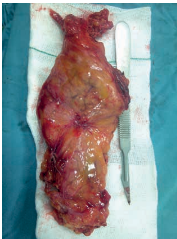
Figure 2. Distal of Pancreas after Extraction with Mass and Splenic Artery and Vein

diet without any problem. After ensuring that there was no leakage of pancreas stump and discharge of the drain decreased, drain was removed (five days after operation).