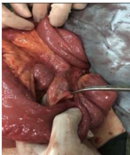
Figure 1. Internal hernia into mesojejunal space which was repaired with non-absorbable running suture before

threshold for explorative laparoscopy/-tomy remains the cornerstone of appropriate treatment.