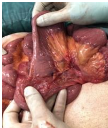
Figure 2. Reduction of internal hernia from mesojejunal space and repair of defect with prolene 2/0 running suture

Conflicts of Interest: The authors declared no conflict of interest