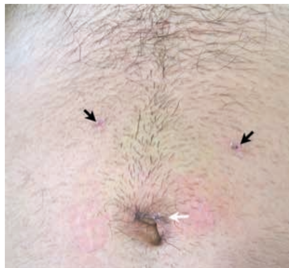
Figure 3. Aesthetic Outcome of Minilaparoscopic Incisions for the Repair of an Inguinal Hernia, One Week After Surgery. Note Two Small Punctiform Scars Corresponding to the Mini Trocars (Black Arrows) and a Longitudinal Scar at the Level of the Umbilicus Corresponding to a 10 mm Laparoscopic Trocar (White Arrow)

proper working space) in a recurrent hernia. The mean hospital stay was 18 ( \pm 6 ) hours. Regarding post operative pain, all patients were instructed to take on-demand pain killers (nimesulide 100 mg orally) after discharge. Analgesia was necessary for more than 2 days only in 8 patients (13.3%). The remaining patients reported no pain after this period. Seroma formation was observed in ten patients (16%); a persistent seroma was seen in two of these patients for more than four weeks, but there was no need for drainage. There were no recurrences during the 4-week follow-up period. Of the male patients, 44 were active workers (83%); the remaining nine were retired. Sixteen (37%) of the male workers took just 1 week off work, while the remaining 28 (63%) took 2 weeks off. One of the women was an active worker and stayed away from her professional activities for 10 days. When asked about the aesthetic outcome, 58 (96%) of the patients considered it to be excellent. Only two rated it as merely good. (Figure 3).