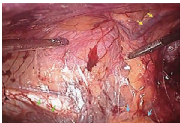
Figure 2. Laparoscopic Inguinal Hernia Repair (Right Side) Using Mini Instruments. Endoscopic View of Anatomical Landmarks: Epigastric Vessels (Yellow Arrows), the External Iliac Vein (Green Arrows), and Direct Right Hernia, Already Dissected Towards the Bottom (Blue Arrows)