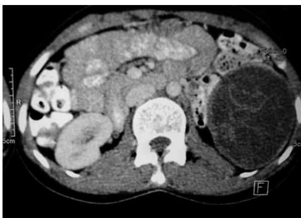
Figure 1. Harmonic Scalpel Used in Dissecting the Cyst From Lateral Wall

Hydatid disease in humans occurs as a result of infection by the larval stages of taeniid cestodes of the genus Echinococcus . Certain human activities (i.e. the widespread rural practice of feeding dogs the viscera of home-butchered sheep) facilitate transmission of the sheep strain and consequently raise the risk of humans getting infected (3). Hydatid cysts of the spleen are the only recognized parasitic cysts and are known to be at least twice as common as the non-parasitic variety (1). Systemic dissemination and intra-peritoneal spread from a ruptured liver cyst are the potential theories behind development of splenic hydatid cysts. The embryo is embolized in the periphery of splenic capillaries. The incompressible mass of the cyst gradually crushes the segmentary vessels, with extensive pericys-