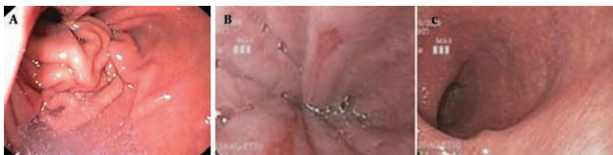
Figure 3. A) Hiatus Hernia; B) Grade A Esophagitis Stomach One Month After sleeve gastrectomy; C) Endoscopic View One Month After sleeve gastrectomy