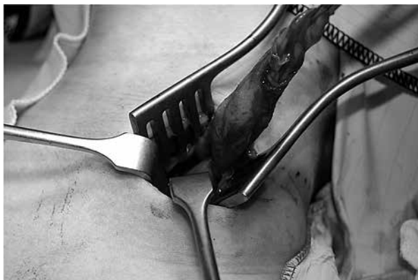
Figure 2. Intra-Operative View Demonstrating Stripping of the Branchial Cyst From Within the Abscess Cavity

out a definitive treatment simultaneously and this was explained to the patient and her parents. The patient was taken to theatre where under a general anaesthetic with the neck extended and turned to the right, an abscess was opened and drained. A 3cm transverse skin crease incision was employed and more than 200 mL of pus evacuated. The lining of the abscess was then stripped off the capsule in a continuous piece, starting immediately under the wound, extending to its inferior and lateral limits before finally removing the superior aspect. (Figure 2) For the most part, despite the infection, separation was relatively bloodless and expeditious. Feeder vessels were controlled, as and when encountered, with bipolar diathermy. The resultant cavity was checked for haemostasis and after comprehensive washout was drained with a suction drain. The patient was sent home the following day and the drain removed 48 hours later. Microbiology of cyst's content revealed nil growth and histology confirmed a squamous epithelium lined branchial cyst with associated acute and chronic inflammation without dysplasia or malignancy. On medium term follow up no recurrence