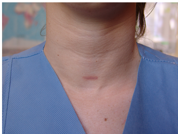
Figure 3. The Site of Surgery 2 Weeks Following Minimally Invasive Video-Assisted Thyroidectomy (MIVAT)

mentary considerably shorter scar that would certainly be less visible on the long run (Figure 3).