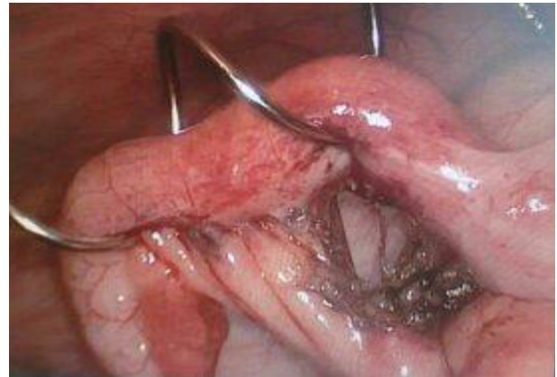
Figure 1. Mini-Laparoscopic Appendectomy with Using Percutaneous Transabdominal Spiral Needle for Fine Handling of the Appendix to Avoid Its Rupture and Prevent Peritoneal Contamination

Patient demographic and postoperative surgical outcomes among the two groups are listed in Table 1. The patients ages of group A ranged from 16 to 49 years (mean, 21 years) and in group B ranged from 18 to 56 years (mean, 25 years), P = 0.053 . Group A included 60 patients (35 males and 25 females) and group B, 60 patients (32 males and 28 females), P = 0.071 . Mean operative time in group A was 55.7 minutes (range, 27 to 90) and in group B 57 minutes (range, 25 to 95), P = 0.0231 . The severity of appendicitis was similar in both groups (27 catarrhal appendicitis 45%, 20 suppurative appendicitis 33.3% and 13 perforated appendicitis