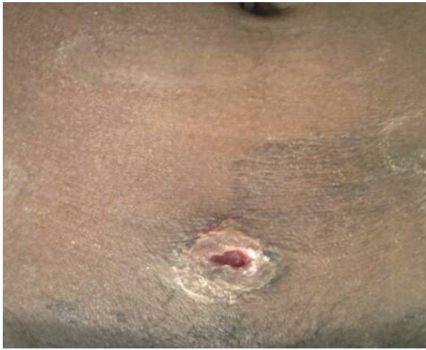
Figure 3. Port Site Infection Was Drained to Evacuate Pus and Daily Dressing

drain. I think, the intra-abdominal abscess may be due to the contamination of peritoneal cavity from port wound infection or appendix contents during its extraction from port without using reusable retrieval bag.