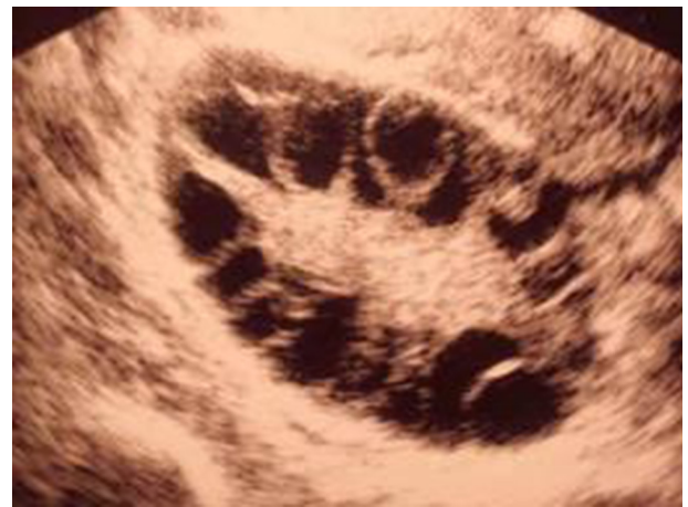
Figure 1. Ultrasound Picture of PCO

The principal features of PCOS are anovulation, resulting in irregular menstruation, amenorrhea, ovulation-related infertility, and polycystic ovaries. The main features of our patient, including primary amenorrhea, infertility and ultrasound (U/S) report, as well as laparoscopy con-