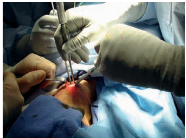
Figure 2. The Endoscopic Instruments are Inserted Through the Single Midline Access, Which Is Maintained With Opposing Retractors