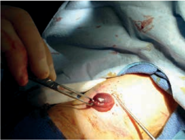
Figure 3. Once Freed From Surrounding Tissue, the Right Lobe of the Thyroid is Removed